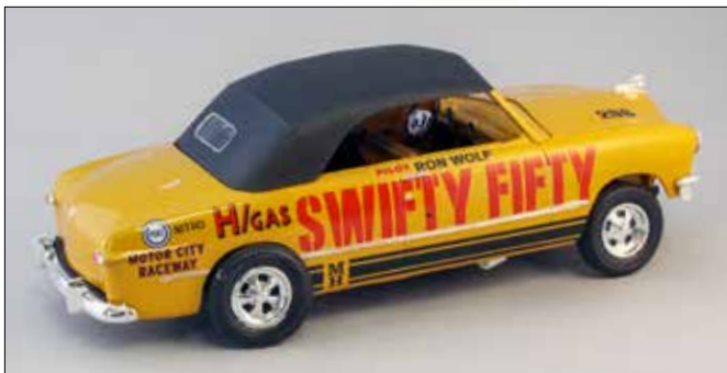
Ken Reimers's Swiftly Fifty 1950 Ford convertible gasser is a box-stock tire-fryer with a Caterpillar yellow finish.