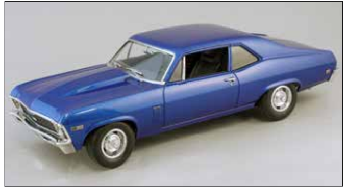
Clean, athletic, and blue – we like Jerry Woodell's box-stock build of a Revell 1969 Chevy Nova.