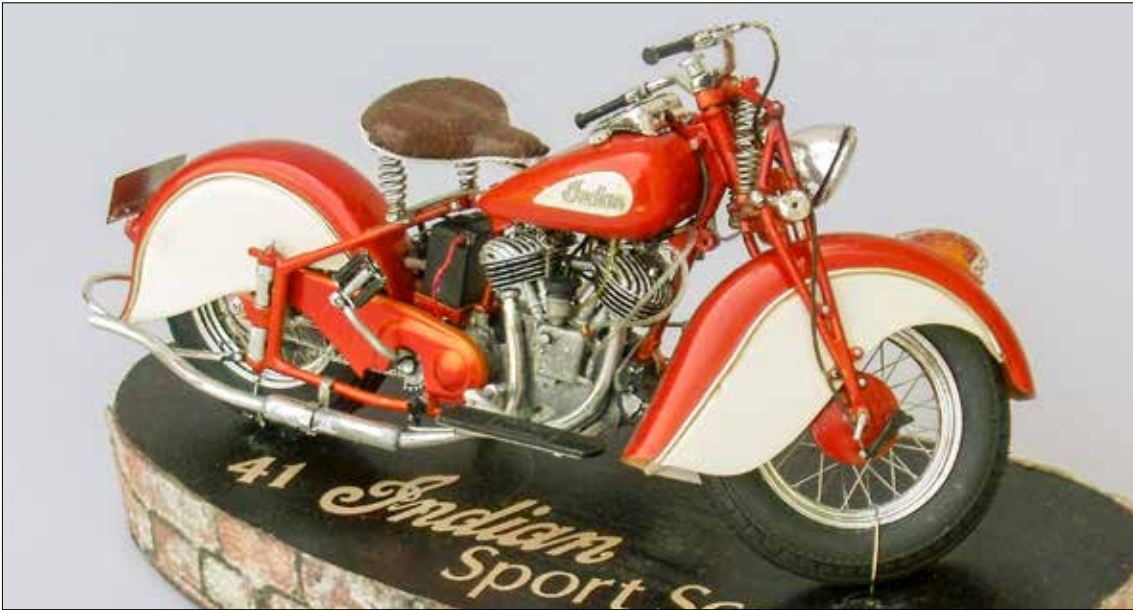
Barry Rawson spent quite a long time building Gunze Sangyo's 1941 Indian Sport Scout cycle, including four days to lace its wire wheels. The seat has real leather, the engine is plumbed and wired, and he finished it all with Spaz Stix candy orange, pearl gold, and Wimbledon white.