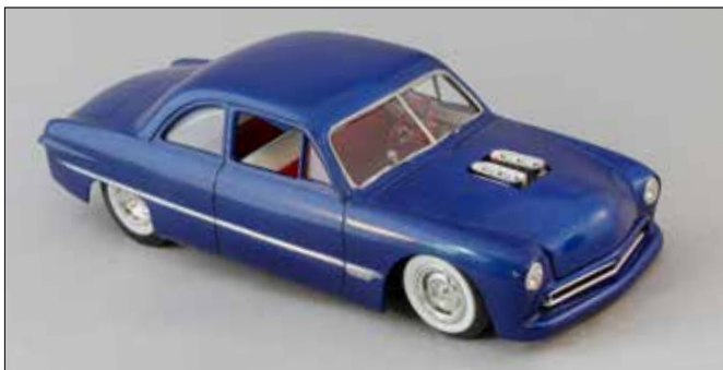
Rich Riedesel shortened his AMT 1949 Ford coupe by 4 scale inches before lowering it. The coupe wears a custom front end and a rear pan, has a Pontiac engine with six carburetors, and the steering wheel from a 1957 Ford.