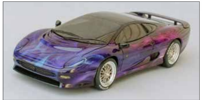
Plastic models of Jaguar's XJ220 supercar are a rare sight, but Ken Boyer brought out his finished AMT kit. It all comes together with a finished engine and custom paint.